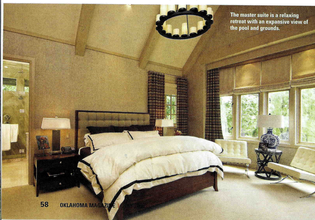
The master suite is a relaxing retreat with an expansive view of the pool and grounds.

opulent master suite, complete with a luxurious double walk-in closet.