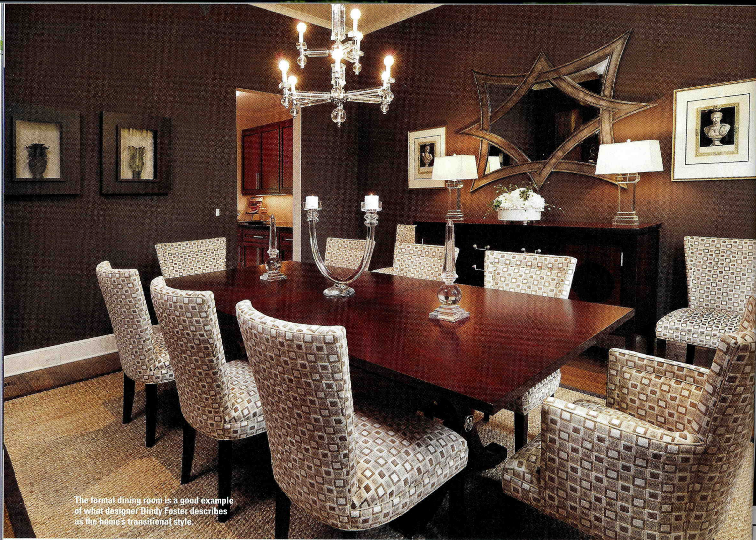
The formal dining room is a good example of what designer Dindy Foster describes as the home's transitional style.