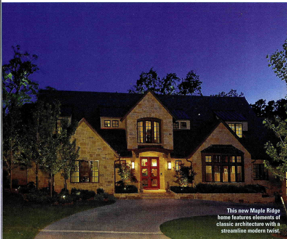
This new Maple Ridge home features elements of classic architecture with a streamline modern twist.