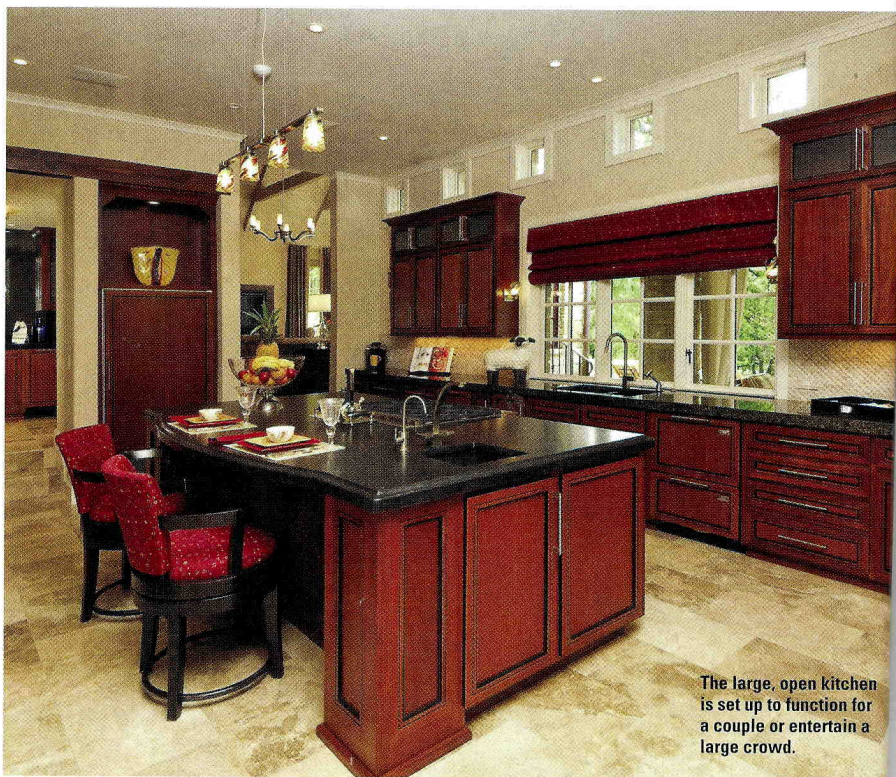
The large, open kitchen is set up to function for a couple or entertain a large crowd.

And while entertaining is important to the homeowners, Perkins notes public areas are balanced by private ones; an intimate home theater with attached game room area and an