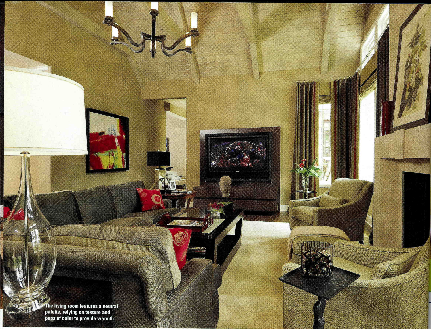
The living room features a neutral palette, relying on texture and pops of color to provide warmth.