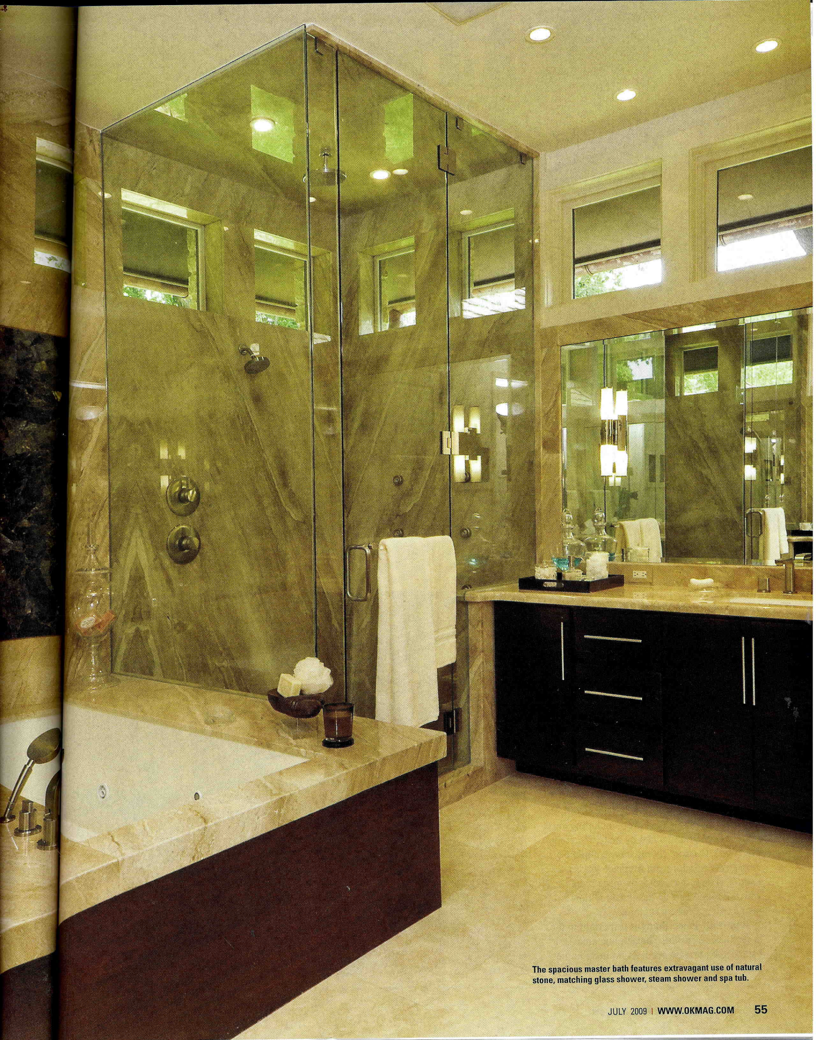
The spacious master bath features extravagant use of natural stone, matching glass shower, steam shower and spa tub.